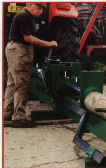
4 Way Splitter Fitted