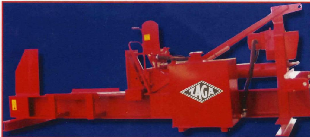
Model OM23H/STD/CD 23 Ton standard