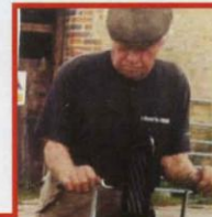
Showing 2 Handle Control