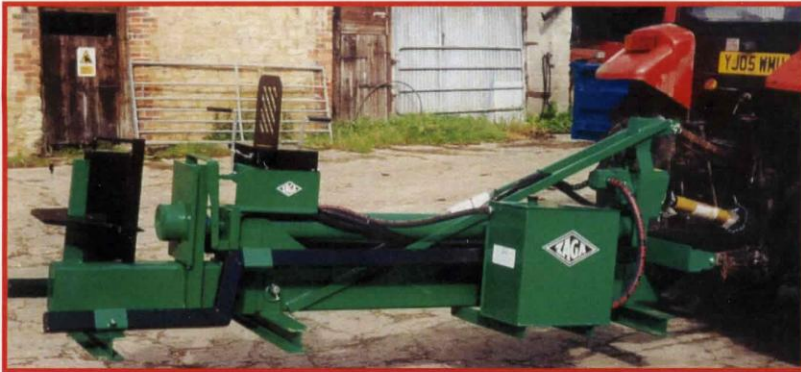
Model OM23H/CD/L 23 Ton extendable